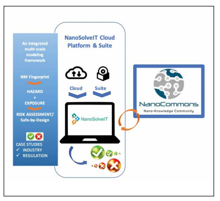
Fig. 1 Illustration of the NanoSolveIT nanoinformatics platform

NanoSolveIT, a research and development project which started on 1 January 2019 and will run for 50 months, brings together 16 partners from EU and associated countries and eight international partners from the USA, Australia, South Africa, Japan and South Korea. These European and international teams have individually or in small groups developed the current state of the art in nanoinformatics. Through each of its partners, NanoSolveIT inherits invaluable knowledge from previous projects and initiatives including